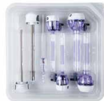
Portable Trocar set