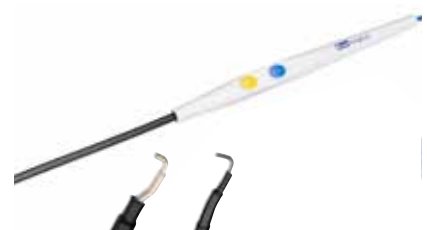
Blue Diathermy Pencil