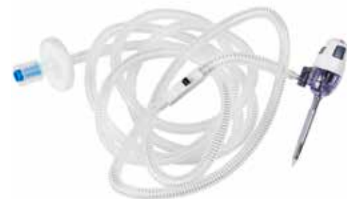
Delivered with 3m tubing

Unt quas molupta quiande mperit evelescium fugitae con esto et ut aces dolluptur a estiis expliti tota int premporum nectianditis duciisc iustis est pro tem fuga. Ut odis ad maximus expliquis esciend itatqui omnienditas doluptur magname solest quibus aut prorro con est dolore delectur, odiae sa pe pore re ni coresse.