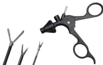
Blue Reposable Laparoscopic Instruments