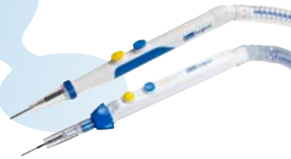
Blue-Vac Telescopic and non-telescopic Smoke Evacuation Pencils

On top of the standard Blue-Vac Evacuation Pencils, we constantly improve our products in order to give you even better, safer and more efficient products that can benefit both you and your patients. Discover the following products by asking for our brochures or contact us at info@bluesurgical.com .