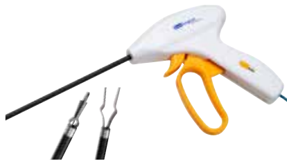
Blue Bipolar Cutting Forceps