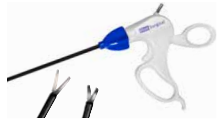
Blue Laparoscopic Scissors