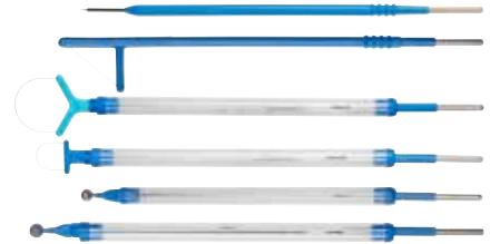
Blue-Vac electrodes available in various material and sizes